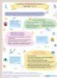
— Epstein, T. (2025). Can play help children to cope with anxiety? Culture Play Canada.

"Some doctors and nurses [say] that, sometimes when children are injured and need attention in emergency rooms, it's because the child did not know how to safely navigate a potential threat, or they did not know what pain the activity could cause them. They believed that when children have time to understand the consequences of their actions and to learn how to successfully overcome anxiety-inducing situations, they can become less anxious over time when facing similar environments (e.g. knowing how to pet dogs without scaring them and being bitten). This in turn helps them learn to regulate the emotions they experience. Play that is thrilling, exciting, and challenging, even if it could result in minor pain and injury, is encouraged!"